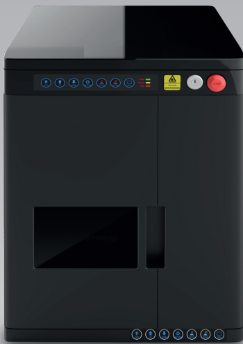
Class 1 solution

Closed enclosure with safety window for inspection